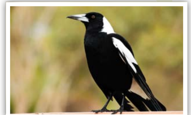
Australian Magpie Gymnorhina tibicen