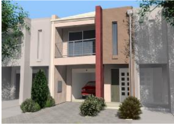
OPTIONAL FRONT ELEVATION

Lochiel Park. Campbelltown Living with nature.